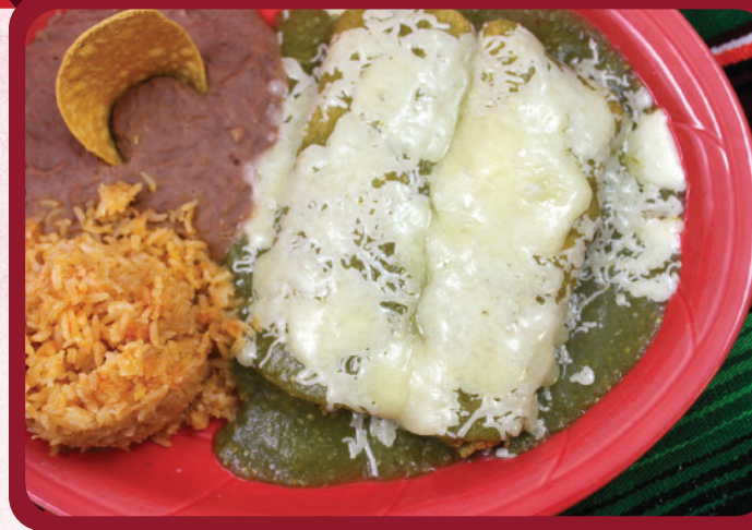
Tomatillo Chicken Enchiladas