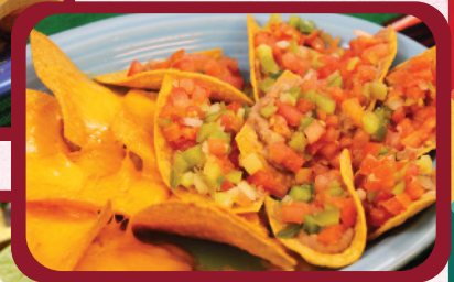
1/2 + 1/2